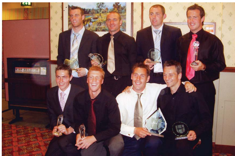
All Award Winners