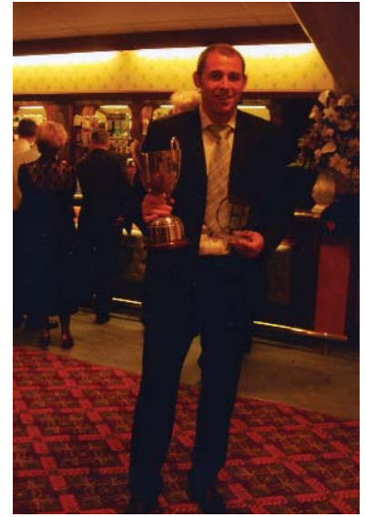
Matty Glennon Trust Player of the Season